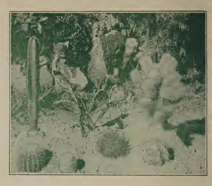
Upper row, left to right: Cereus peruvianus, Opuntia monacantha variegata, Opuntia bigelovi; lower row: Echinocactus gusoni, Neomammillaria geminispina, Ferocactus acanthodes, Astrophytum ornatum.